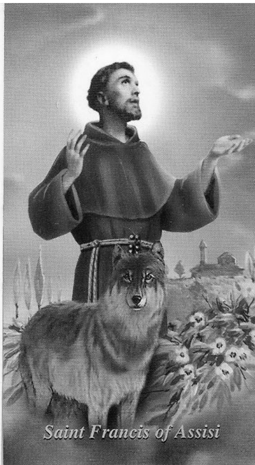
Saint Francis of Assisi

In your infinite wisdom, Lord God, when You created the universe you blessed us with all living creatures. We especially thank you for giving us our pets who are our friends and who bring us so much joy in life. Their presence very often helps us get through trying times. Kindly bless my pet. May my pet continue giving me joy and remind me of Your power. May we realize that as our pets trust us to take care of them, so we should trust You to take care of us, and in taking care of them we share in Your love for all Your creatures. Enlighten our minds to preserve all endangered species so that we may continue to appreciate all of your creations. Grant this through Christ our Lord. Amen.